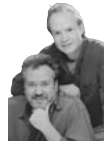
Jim Borgman and Jerry Scott

cartoonist, moods of cinnati to start work